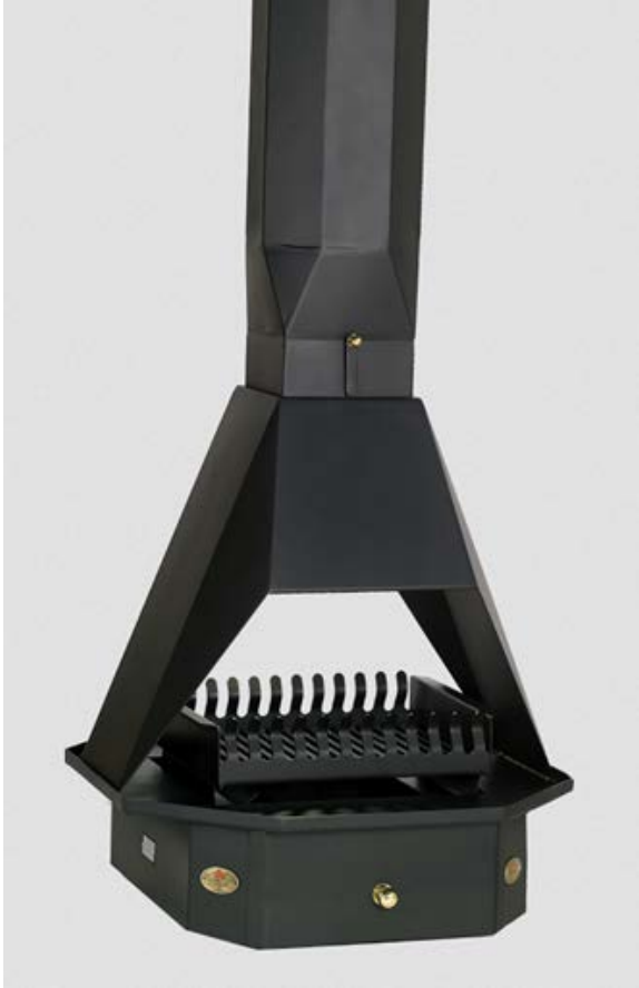
DOUBLE SIDED FREESTANDING UNIT