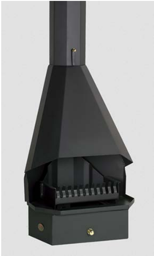
FREESTANDING VICTORIAN CORNER UNIT