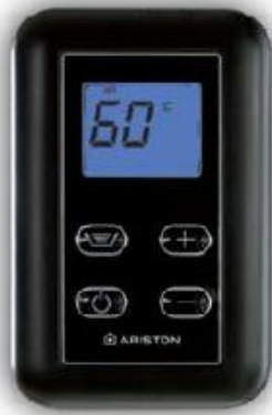
REMOTE CONTROL (with 30m cable)