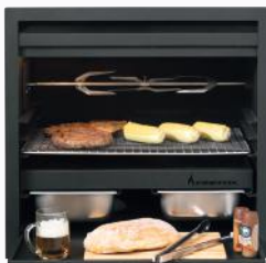
700 MULTIFUNCTION CHARCOAL FULL MILD STEEL/3CR12 PAINTED BLACK