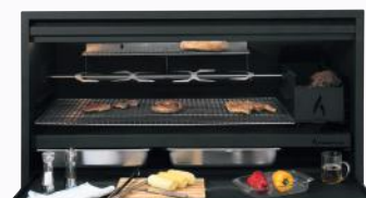
1500 MULTIFUNCTION CHARCOAL FULL MILD STEEL/3CR12 PAINTED BLACK

10 YEAR WARRANTY on Built In Braai Boxes | 3 YEAR WARRANTY on Gas Grills