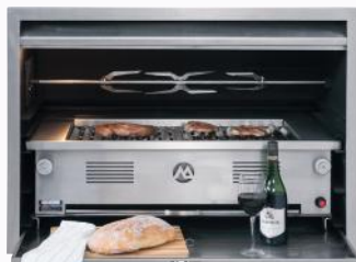
1000 MULTIFUNCTION GAS MILD STEEL/3CR12 BODY PAINTED BLACK STAINLESS STEEL FRAME & DOOR