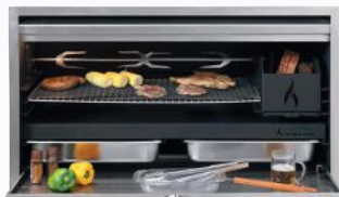
1200 MULTIFUNCTION CHARCOAL MILD STEEL/3CR12 BODY/INNERS PAINTED BLACK STAINLESS STEEL FRAME & DOOR