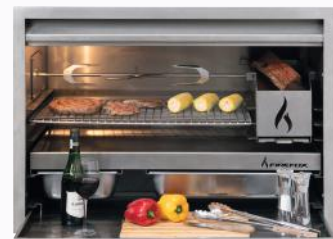
1000 MULTIFUNCTION CHARCOAL FULL STAINLESS STEEL