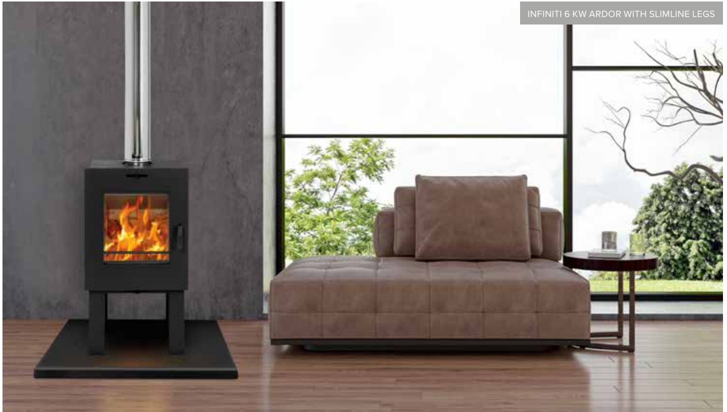
INFINITI 6 KW ARDOR WITH SLIMLINE LEGS